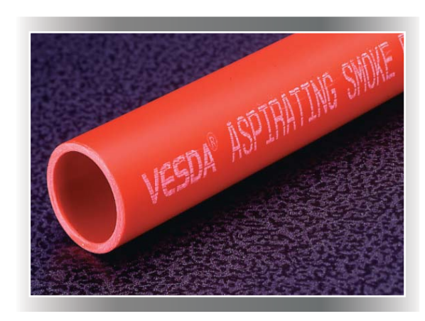
Both VSC and ASPIRE2 are compatible with all detectors in the VESDA product line.

Some pipes and fittings are not available in certain countries. Please check with an Xtralis office before you order.